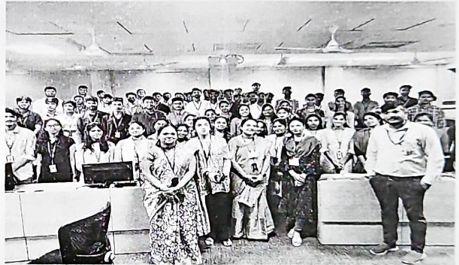
Students and staff group photo with ETA Department, Infosys